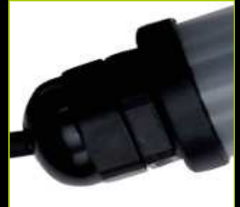
IP64 End Cap