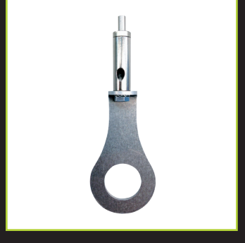
Tear Drop Suspension Kit