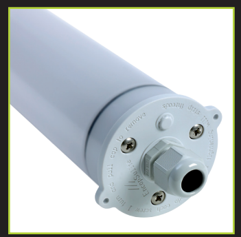
IP67 End Cap