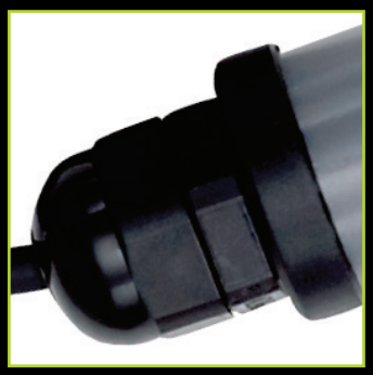
Black End Caps