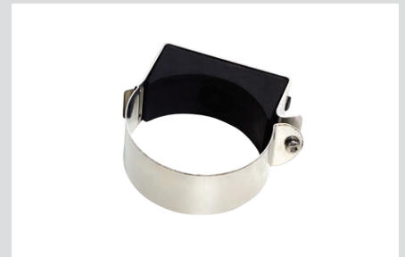
Stainless steel clamp