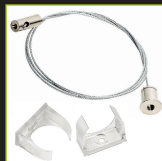
Suspension Kit & Polycarbonate Clips