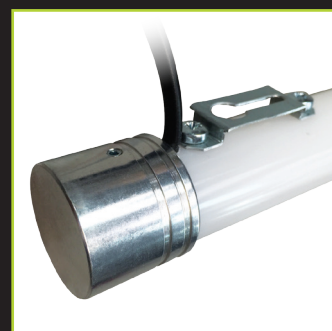
Discreet Rear Mount and Side Entry Cable