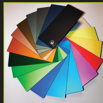
Available End Cap colours