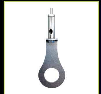
Tear Drop Suspension Kit