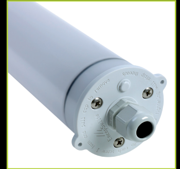
IP67 End Cap