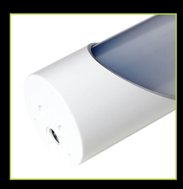
White End Cap