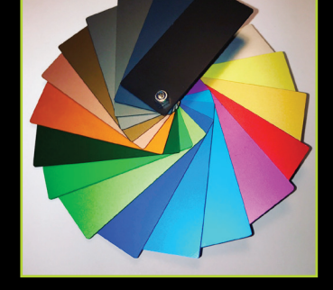
Available End Cap colours