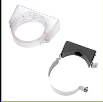
Plastic & Stainless Steel Clamps