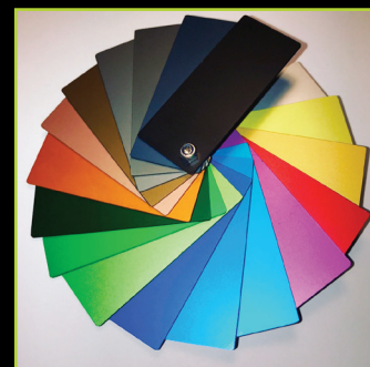
Available End Cap colours