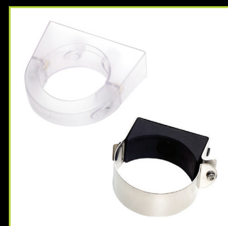
Plastic & Stainless Steel Clamps