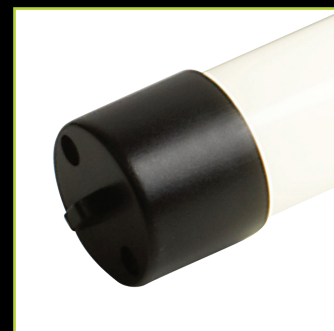
Black End Cap