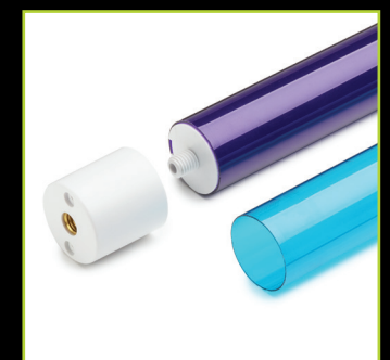
DDP Coloured Sleeves