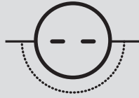
Light output 180°