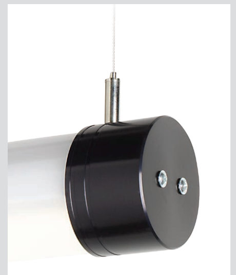
Chrome end cap standard Black optional

Suitable for almost any interior application.