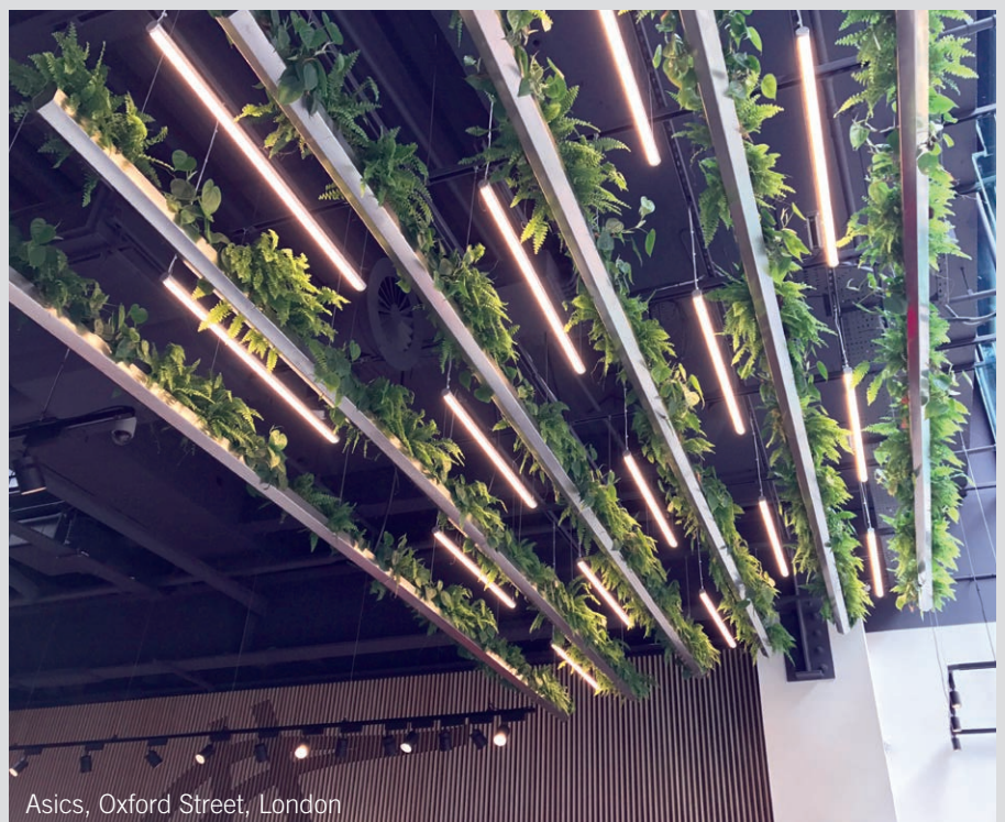
Asics, Oxford Street, London

Suitable for almost any interior application.