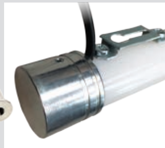
Discreet rear mount showing side cable entry. End cable entry is standard.